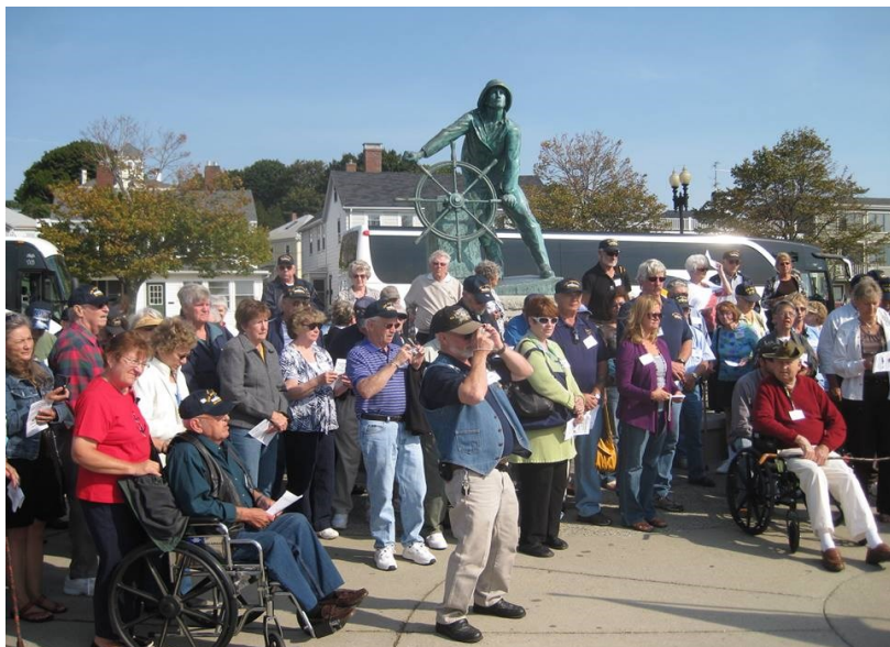
Memorial -14Th Reunion, Salem Mass. 2010

Crew after FRAM II: 14 officers, 260 enlisted