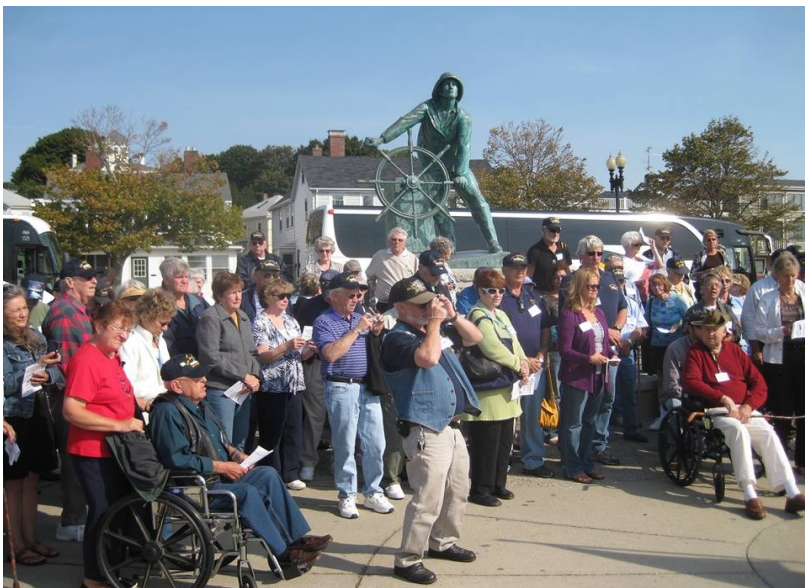
Memorial -14Th Reunion, Salem Mass. 2010

Crew after FRAM II: 14 officers, 260 enlisted